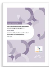
Randomised controlled trial and implementation & process evaluation of Salford Foundation's STEER programme

Examples of projects which have involved substantial input from Senior Consultants include: