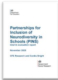
Evaluation of Partnerships for Inclusion of Neurodiversity in Schools