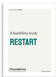
Feasibility study for Drive Partnership's Restart programme