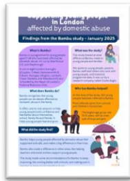
Evaluation of the Bambu programme